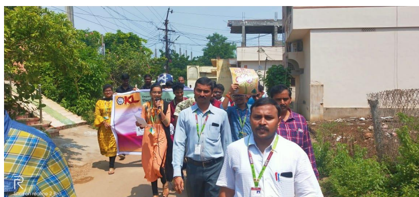
LIST OF SUDENTS PARTICIPATED IN NSS EVENT ON 2nd OCT-2019