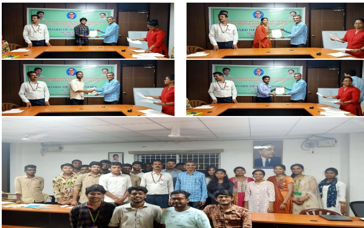
Secretary of APSWREIS appreciating the Student efforts as volunteers